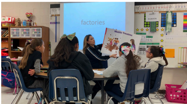
Figure 2. Project ELLIPSES Classroom

In this vignette, a Project ELLIPSES teacher provides evidence-based reading intervention to fourth-grade ELs.